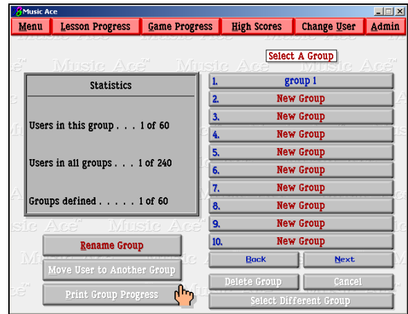
Group Administration page